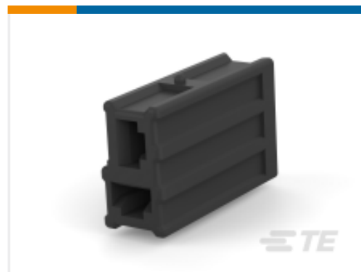
TE Part # 626064-5 ISOLADOR