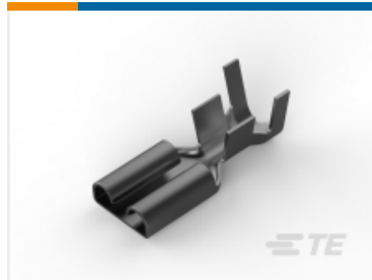
TE Part # 281091-2 FF 375 REC 6-10MM2 TPBR