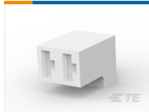
TE Part # 180918 FF 250 REC HSG 2P NYLON CLEAR